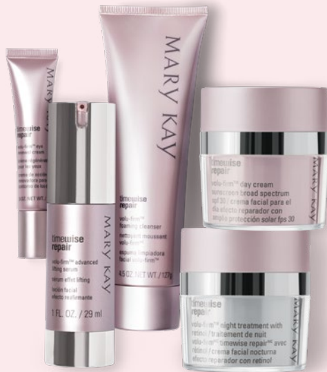
ADVANCED SIGNS OF AGING SOLUTIONS